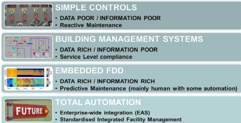
Fig. 1 The four ages of Building Management Systems

CASCADE will explore the third age of building operation by embedding FDD knowledge and converting the raw data in elaborated information with an eye in enhancing predictive and preventive maintenance current practices as the main objective. New and innovative data visualization tools will also be explored as instruments to help energy managers understand, interact with data and foster collaborative decision making.